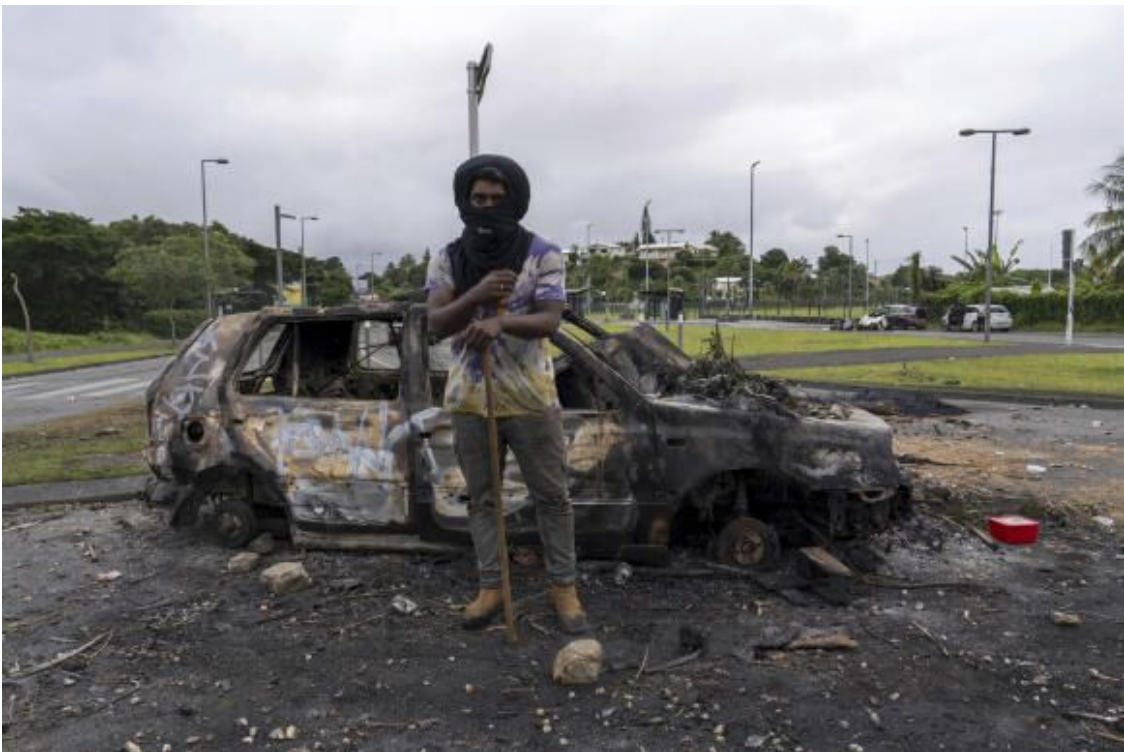
Burning vehicle in Nouméa.

New Caledonia has been the scene of particularly violent rioting since 13 May, which have rocked the capital city, Nouméa . The violence has erupted over a draft constitutional bill aimed at reforming the territory's electorate passed by the National Assembly in the night of 14 to 15 May. The adoption of the bill, which would allow all citizens who have lived in the territory for at least ten years to vote in provincial elections, has sparked anger among Kanak pro-independence supporters , who claim that such an expansion could curb their electoral influence and push the Kanak indigenous people further into a minority. Their anger has taken the form of violent demonstrations , which have deteriorated into rioting plunging the South Pacific French territory into an unprecedented identity, political and security crisis.